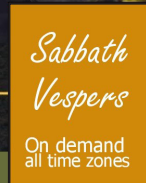
Sabbath Vespers On demand all time zones Association of Adventist Women and Loma Linda University Church